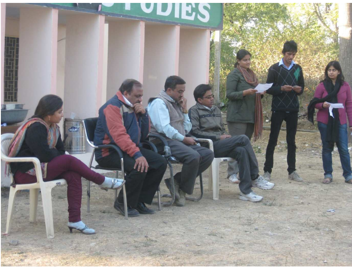
Student presentation on scientific aspects of sun movement during Sakranti