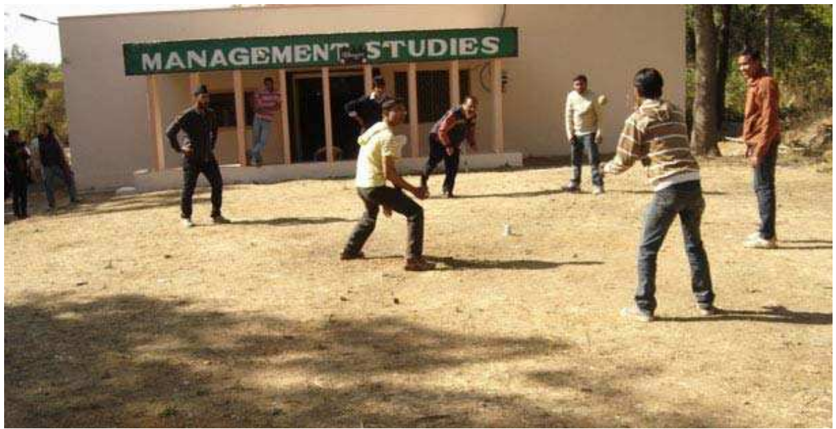
Faculty and students playing sitolia