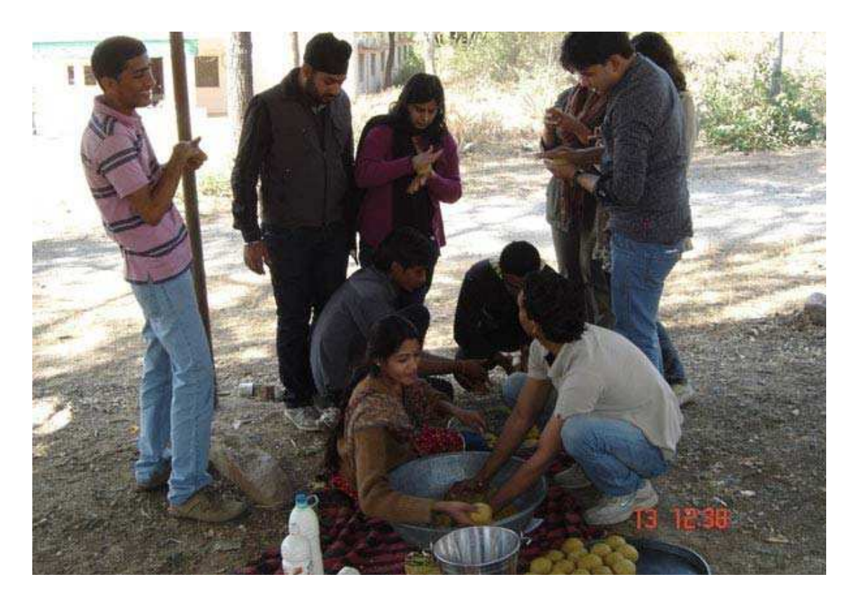
Students cooking traditional food 'Daal Baati'